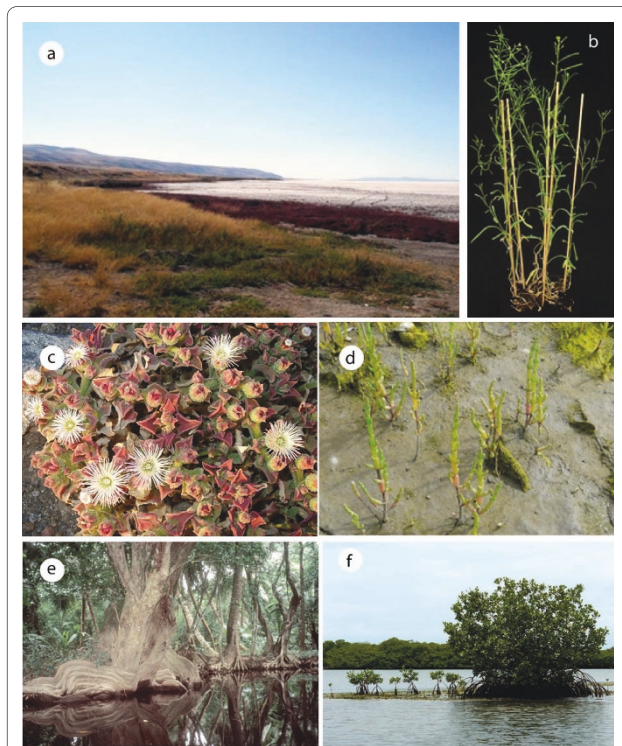
Figure 1. Some examples of extremophiles providing genome- or transcriptome-level data relevant to abiotic stress adaptation. These species are representative of those listed in Table 1. (a) The shores of Lake Tuz in central Anatolia (Turkey) were the original collection site for Thellungiella parvula (b) . Note the extensive salt flat where an ephemeral lake would be in a rainy season. (c) Mesembryanthemum crystallinum , known as the common ice plant for the salt crystals excreted from bladder cells on the leaves and stems. (d) Salicornia europaea (a relative of S. brachiata , Table 1) shown in the mud flats at Bull Island, Dublin, Ireland. (e) Heritiera littoralis , one of 27 species in North Queensland, Australia, shown growing along a creek with salinity varying between fresh water and ocean water. (f) Rhizophora mangle , shown as an ocean-fringing forest in the background and as substrate-stabilizing pioneers in the foreground.

closely related to it. One of these is the genome of Arabidopsis lyrata [19], a potential comparative model for drought tolerance [20], and T. parvula (Figure 1a,b) will be perhaps even more useful for elucidating a broad range of environmental adaptations [10]. This species and the congeneric T. salsuginea are endemic to regions that experience temperature extremes, poor, degraded, and toxic soils, and especially very high salinities [6,21]. The T. parvula genome is of particular interest because chromosomal assemblies that approach the coverage of A. thaliana are available. Moreover, because the Thellungiella species share many of the characteristics that led to the acceptance of Arabidopsis as a model (size, growth habit, seed amount, mutants, and transformation ability), they have been recognized as excellent candidates for comparative genomics studies [15,22].