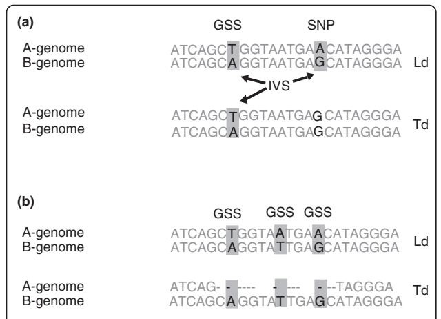
Figure 2 Types of variable sites in the tetraploid wheat genome. (a) At genome-specific sites (GSSs) nucleotide variants represent fixed mutations that differentiate the diploid ancestors of the wheat A and B genomes brought together by interspecies hybridization resulting in origin of allotetraploid wheat. SNP sites originate due to a mutation in one of the wheat genomes (in this example, in the A genome of Ld). Intra-species variable sites (IVSs) are highlighted in grey. (b) An example of CNV due to the deletion of a homoeologous copy of a gene. Deletion of a gene in the A genome of Td resulted in the disappearance of three bases, T, A and A, in the alignment.

a GSS or SNP until it is compared with the sequence of the same genomic region from another wheat line. For that reason we defined sites with two nucleotide variants within a single wheat line as intra-species variable sites (IVSs). Then, according to our definition, GSSs should have IVSs present in both Ld and Td, whereas the characteristic features of SNP sites will be the presence of an IVS in one of the two wheat lines (A and G in Figure 2a) and a monomorphism for one of the variants in another line (G in Figure 2a). Patterns of variation in polyploid alignments are further complicated by intragenomic gene duplications due to paralog-specific mutations accumulated in duplicated genes (excluding genes duplicated via polyploidization).